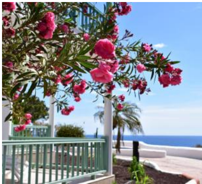
Bungalow with sea view

The Aldiana resort with its tropical ambient, fantastic views, and wonderful gardens provides the perfect spot to regenerate and recuperate from the corona pandemic. The main spoken and written language of the resort is German. Most staff also speak Spanish and English.